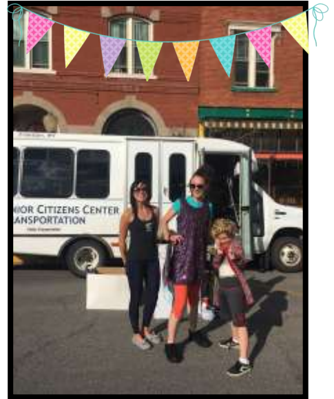
Above: Some of the Amazing Race contestants participating in the Senior Center costume dress up challenge .

This was a fun event put together by the community and we had a blast being involved with all of the excitement!